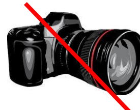
Professional Cameras (Lenses longer than 4")